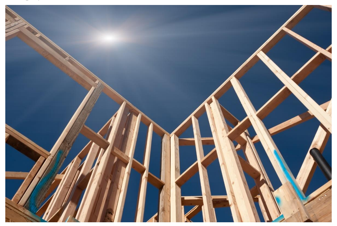
Migrant settlement and integration policies could be enhanced through improved vertical co-ordination and implementation at the relevant scale

help individuals to meet programme requirements in a timely manner and make it easier for them to work, for instance in trainee jobs and vocational introduction jobs. Fast-tracking the recognition of foreign credentials and certificates has been of great help, but partial recognition needs to be better linked to complementary courses. There is a need to strengthen and expand initiatives of early skills assessments, which can enable a better profiling of asylum seekers and improve labour market matching. A related initiative is building a database of newcomers' competences and qualifications, to be made available to employers.